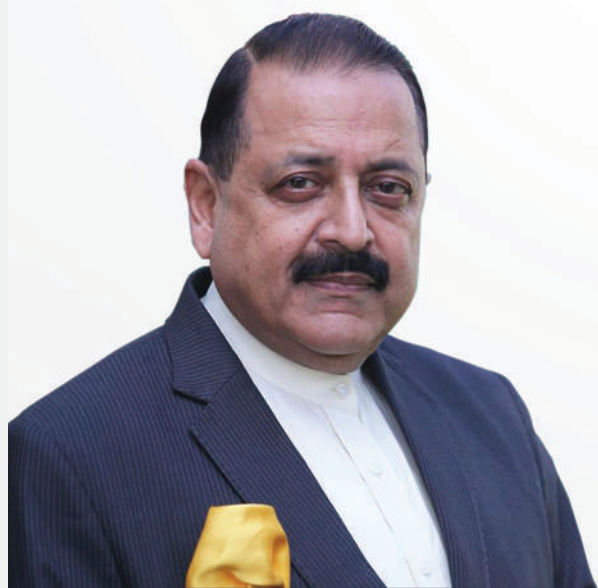
Dr. Jitendra Singh

Hon'ble Minister of State (Independent Charge)