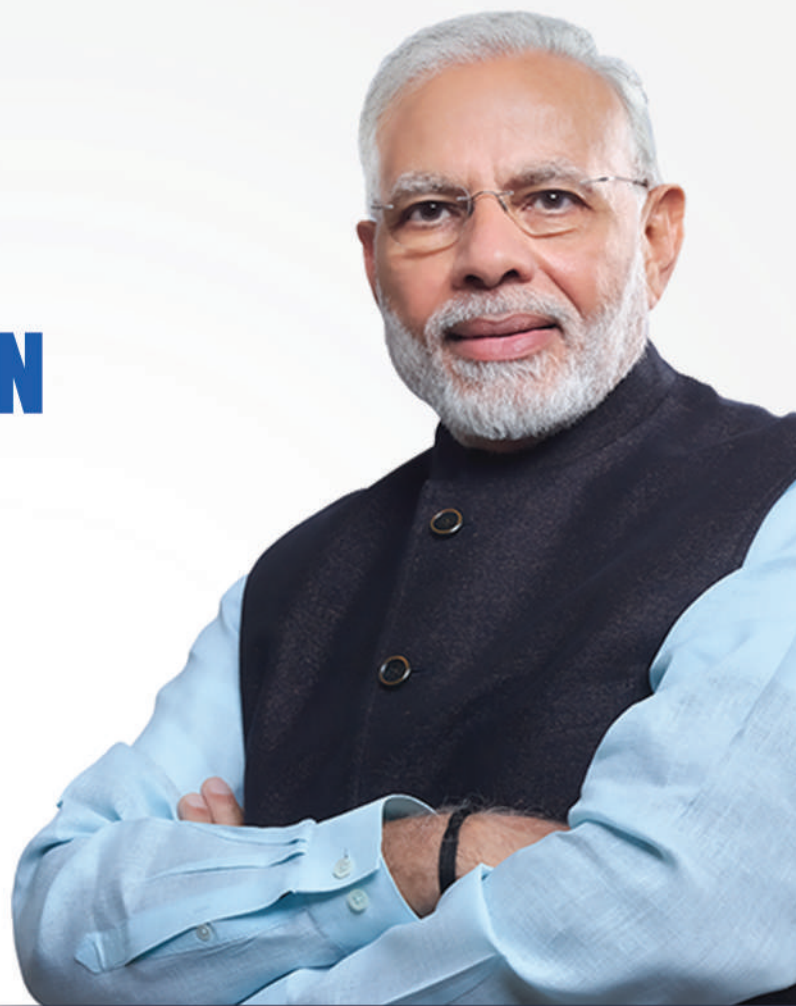
Shri Narendra Modi Hon'ble Prime Minister